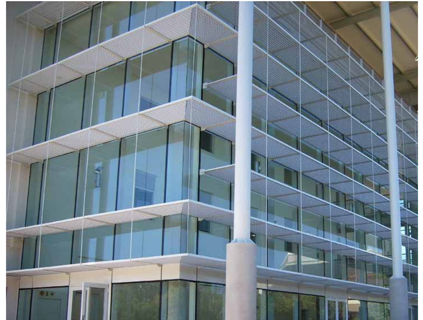
UWC Public Health Building, Bellville

ALUPLAN manufactures and installs a range of aluminium architectural products, primarily for office and industrial building applications.