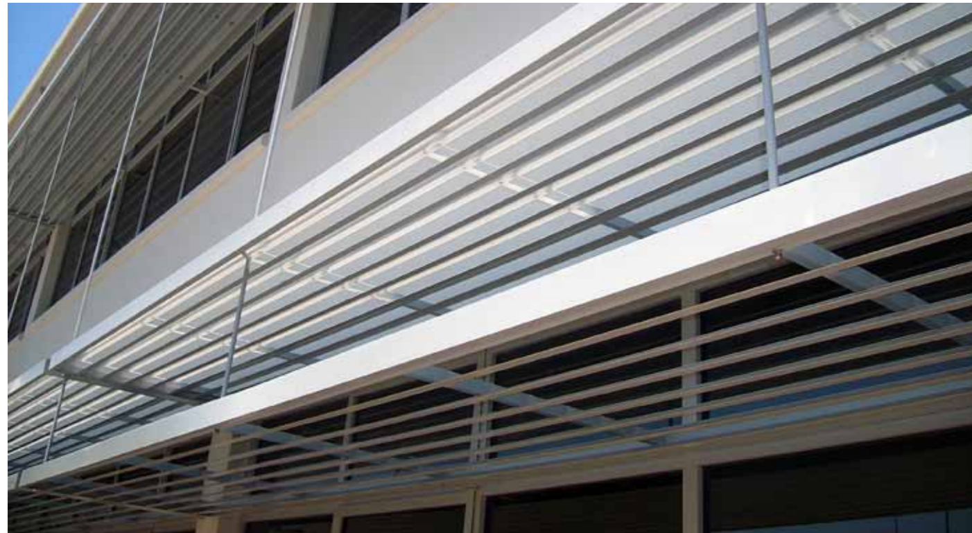
UWC Metology Building, Bellville