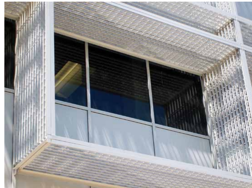
UWC Public Health Building, Bellville