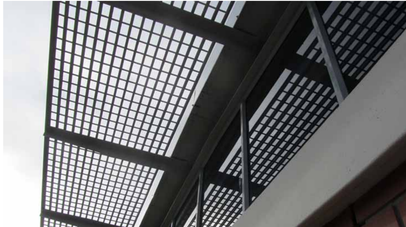
Somerset Hospital, Greenpoint