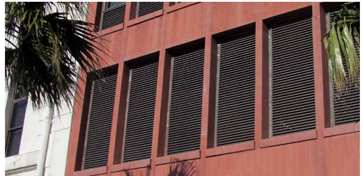
79 Darling Street, Cape Town

Adjustable Louvres allow you the greatest flow of air of any window when fully open. The air flow is able to be varied by changing the pitch of the louvres. Louvres allow an almost unrestricted view while maintaining ventilation.