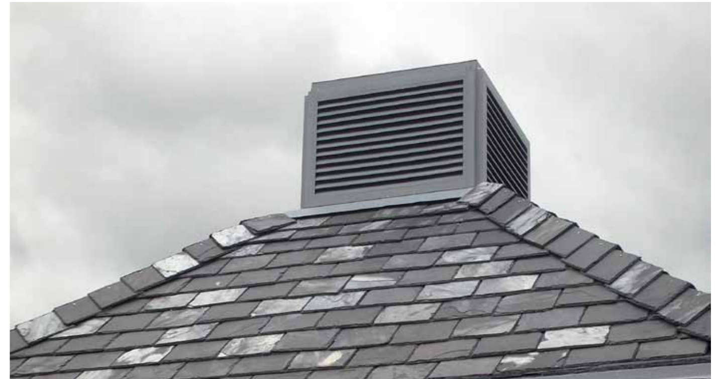
Residence, Pearl Valley