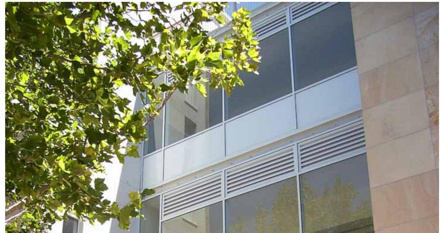
UWC Public Health Building, Bellville