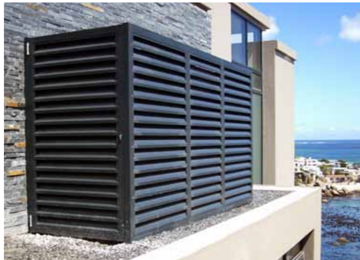
Barley Bay Apartments