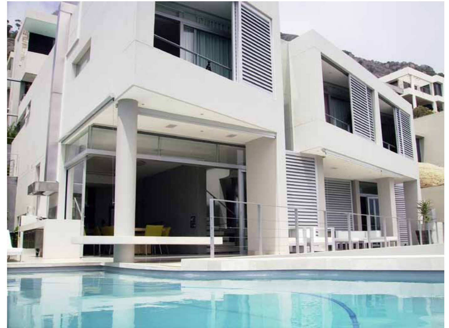
Residence, Arcadia Road, Fresnaye

With ALUPLAN shutters you can secure your openings and ensure privacy with shutters that provide ventilation, sun and rain protection as well as security.