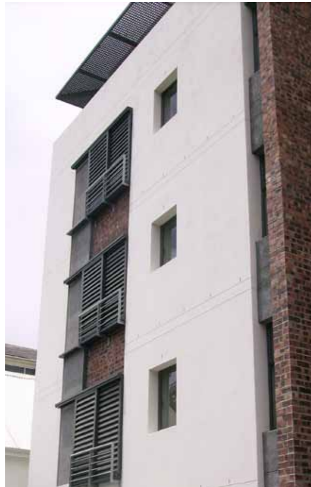
177 Main Road, Greenpoint