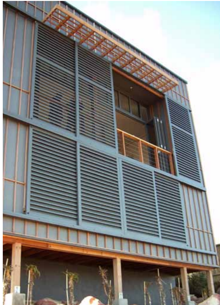
Residence, Pringle Bay