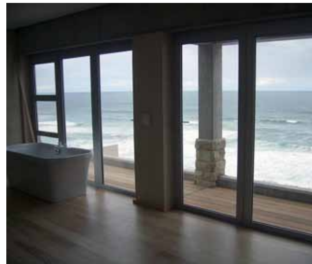
Residence, Groot Brak Rivier. Natural Anodized