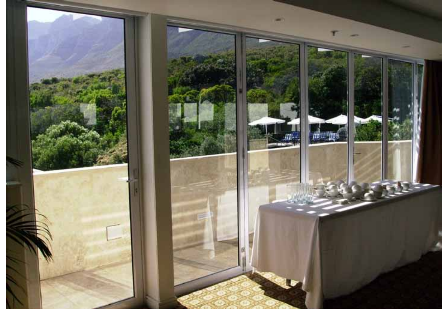
12 Apostles Hotel, Oudekraal

ALUPLAN's stacking slider is the ideal door when you are looking for an economical wide opening door. The doors provide an opening greater than the traditional sliding doors and stack neatly behind one another; out of the way for unimpeded access. The folding doors combine practicality with style and are suitable for a wide range of residential and commercial applications to take advantage of uninterrupted views combined with durability and security.