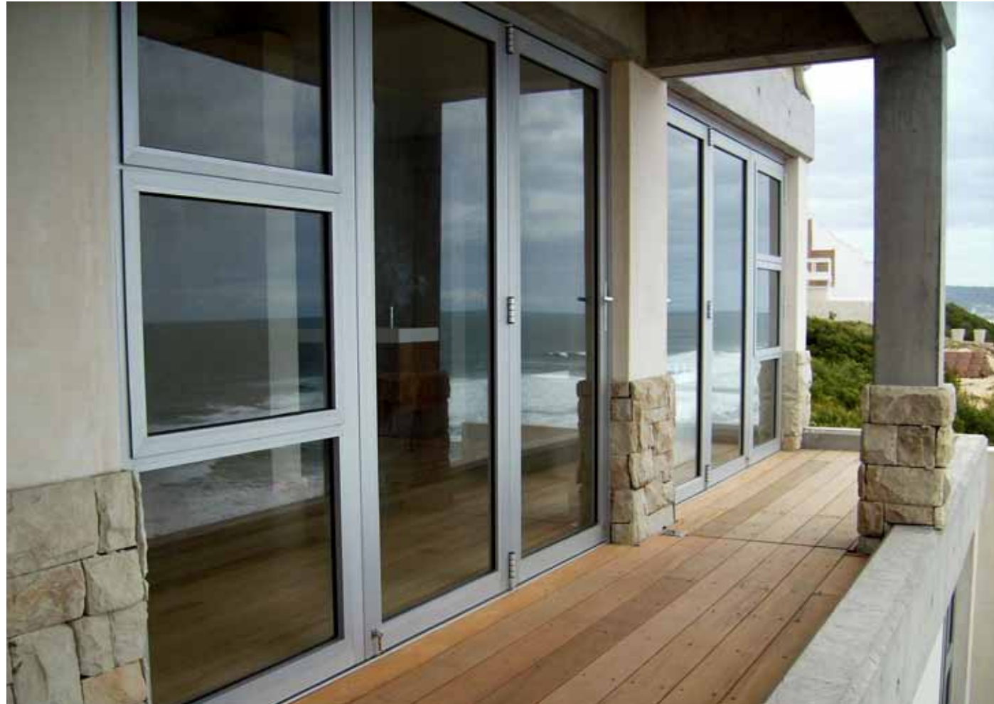
Residence, Groot Brak Rivier. Natural Anodized