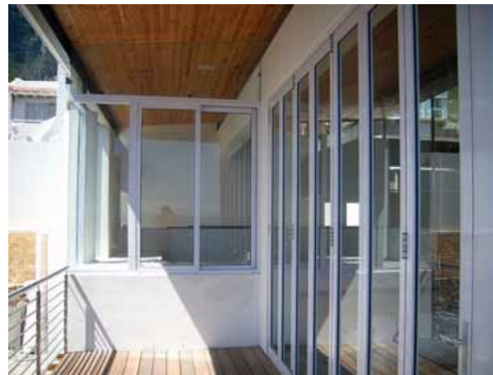
Residence, Theresa Avenue, Camps Bay